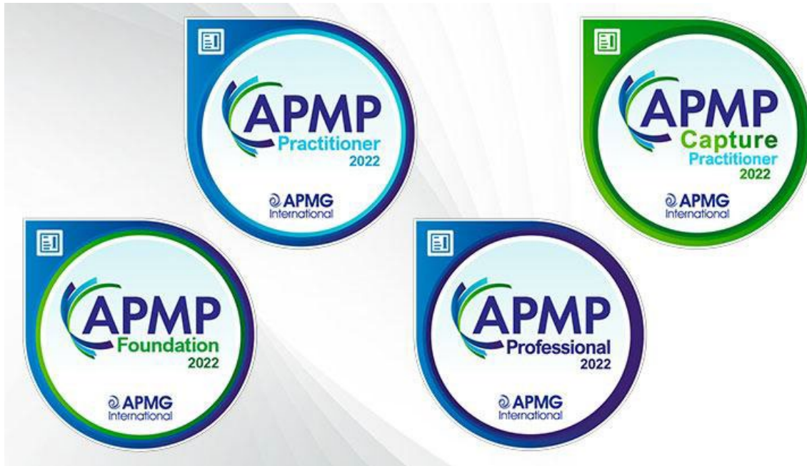
Figure 1: The Certifications levels of APMP are Foundation, Practitioner, Capture Practitioner, and Professional.

To cover the variety of needs APMP offers different levels of certifications corresponding to different levels of skills and knowledge depth. Functions who might not need the full level certifications can also go for recently introduced micro-certifications, which focus on very specific qualification topics instead of the full bandwidth of competences.